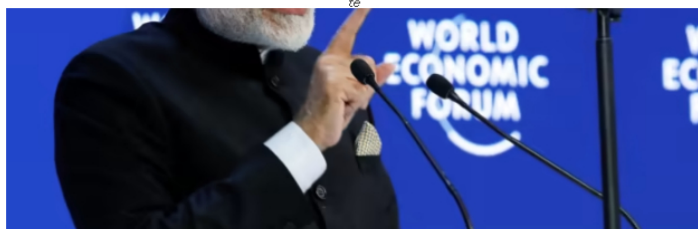
Prime Minister Modi in World Economic Forum.

The attitude of the government, under PM Modi, has explicitly been of minimal government and maximum governance. This is the attitude which has resulted in the risen confidence in the plebeian. A change in the GII ranking does not emanate from a change in some parameters in the economy. It is the outcome of full-fledged involvement of the common public in the actions of governance. More