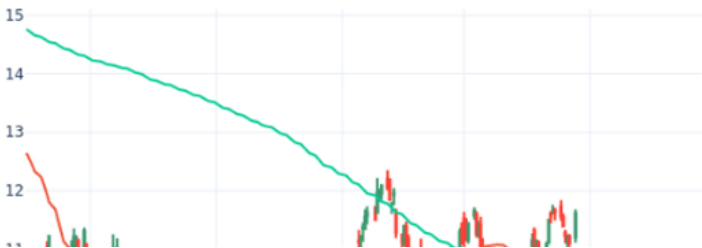
Death Cross For Ecopetrol