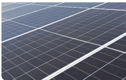
Solar farm.

Colombia's state-controlled oil company Ecopetrol SA (NYSE:EC) has started generating electricity at a 50.1-MW solar farm in the Meta department to supply its upstream operations.