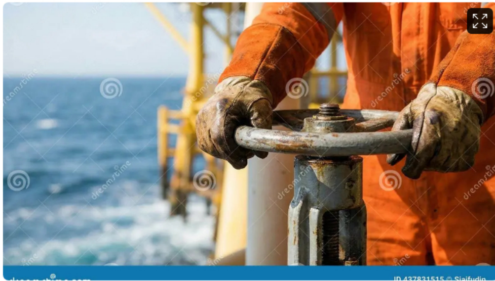
close-up hand operating valves at offshore oil rig plant